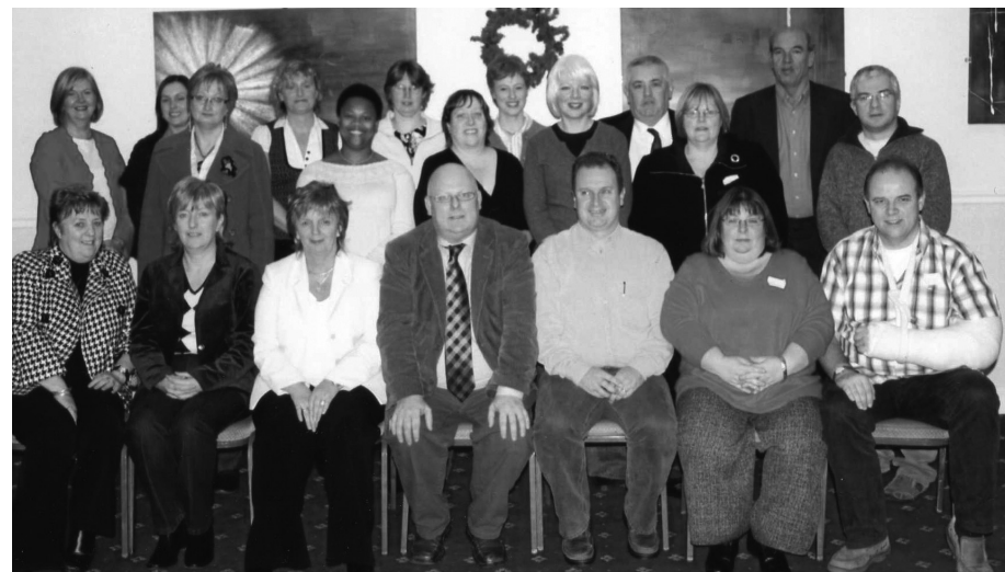
NPC Assembly Members at the first Assembly meeting

On Friday the 23rd and Saturday the 24th of November, the National Parents Council Primary held its first Assembly meeting. The Assembly discussed the topic of children's rights in the Constitution and developed NPC policy position regarding this issue.